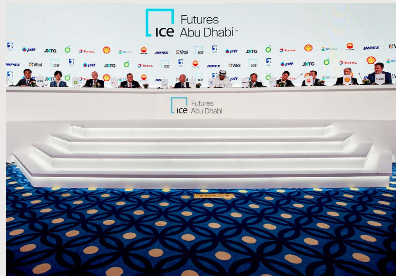
Intercontinental Exchange Partners Launch ICE Futures Abu Dhabi in November 2019.

For a longer FAQ please see: https://www.theice.com/publicdocs/ICE_Futures_Abu_Dhabi_FAQ.pdf