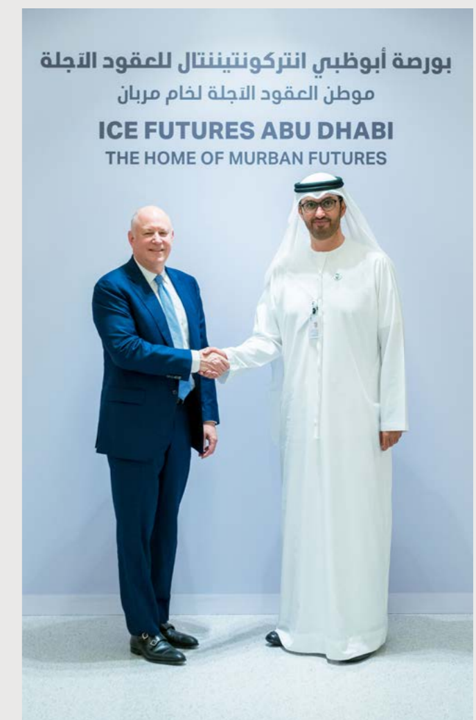
Jeffrey Sprecher, Chairman and CEO of Intercontinental Exchange, and H.E. Dr. Sultan Ahmed Al Jaber, UAE Minister of State and ADNOC Group CEO unveil the launch of ICE Futures Abu Dhabi in November 2019.

ICE Murban Futures will be a physically delivered contract with delivery at Fujairah in the United Arab Emirates (UAE) on a free-on-board (FOB) basis.