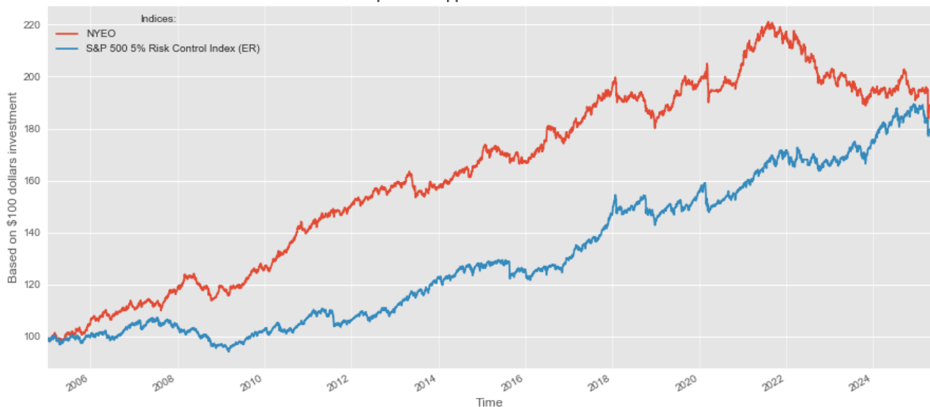
NYSE Expanded Opportunities Index Performance